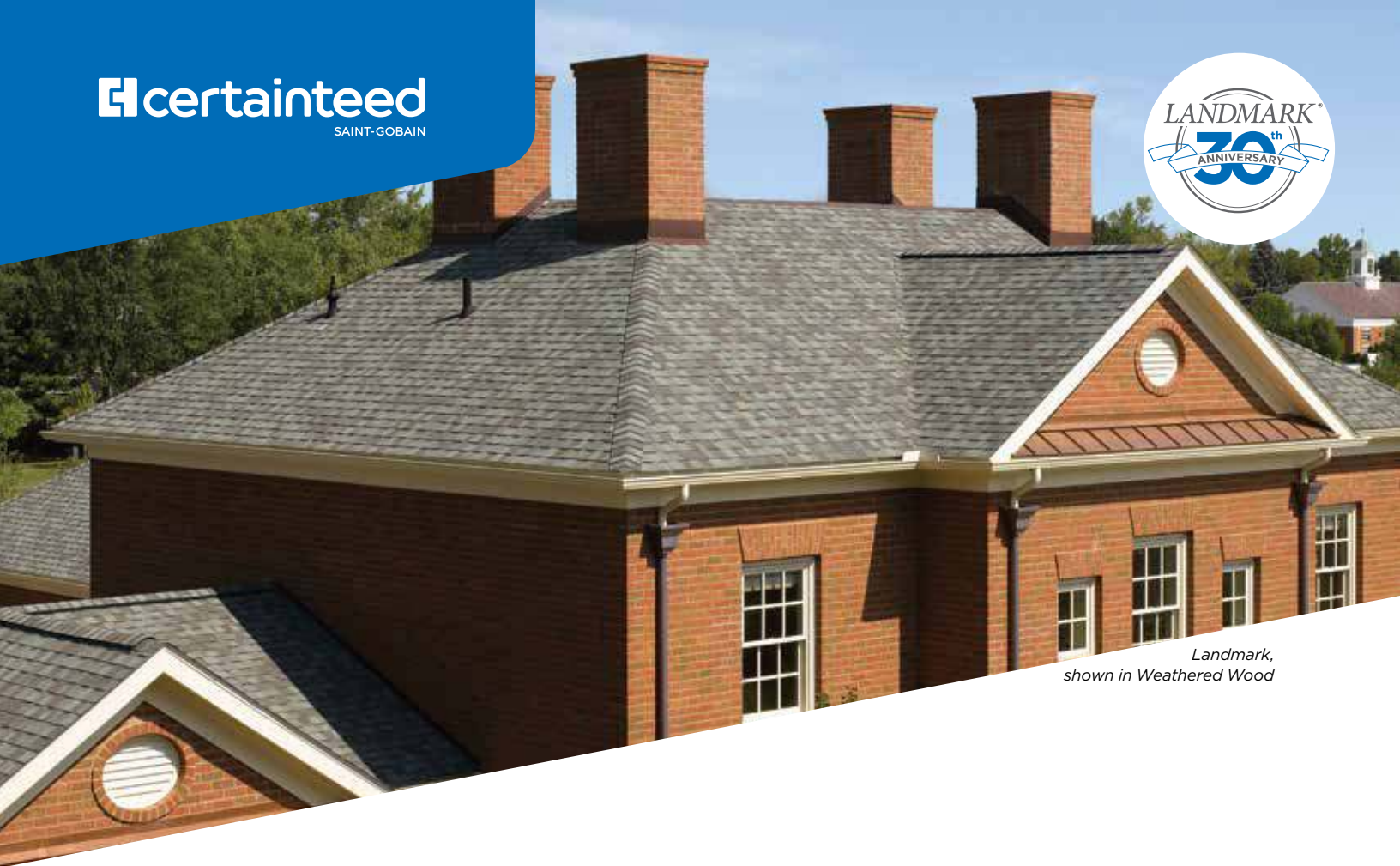
Landmark, shown in Weathered Wood